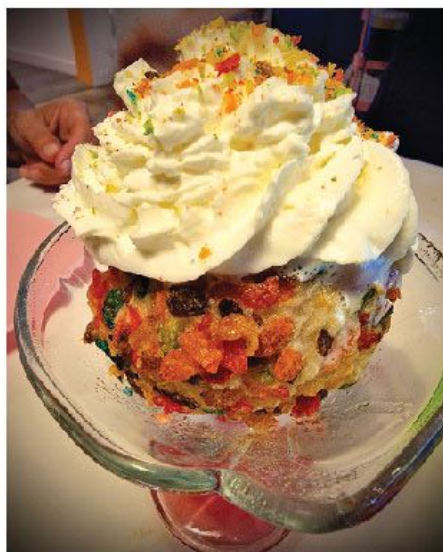
Rainbow Fried Ice Cream