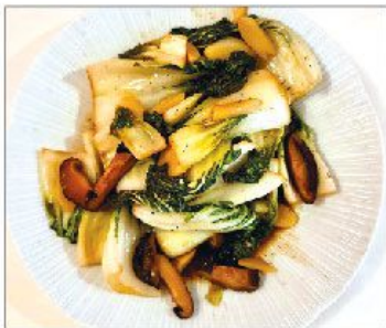
Sauteed Bok Choy