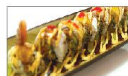
Last Samurai Roll