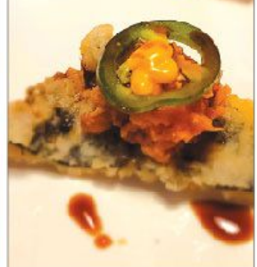
Hi~ Spicy Tuna