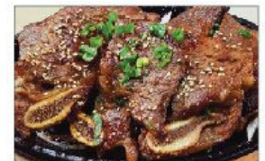
K-Style Beef Short Rib