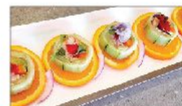
First Class Roll