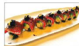
Choo Choo Roll