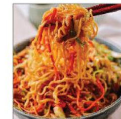
Vegetable Yaki soba