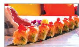
Say Good Bye Roll