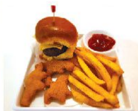
Choo Choo Kids Set