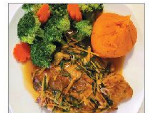
White Fish Special