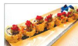
Kick Ma Booty Roll