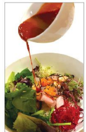
K-Style Sashimi Rice