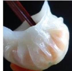
Crystal Shrimp Dumpling