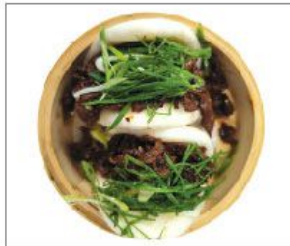
Choo Choo Hot Bun