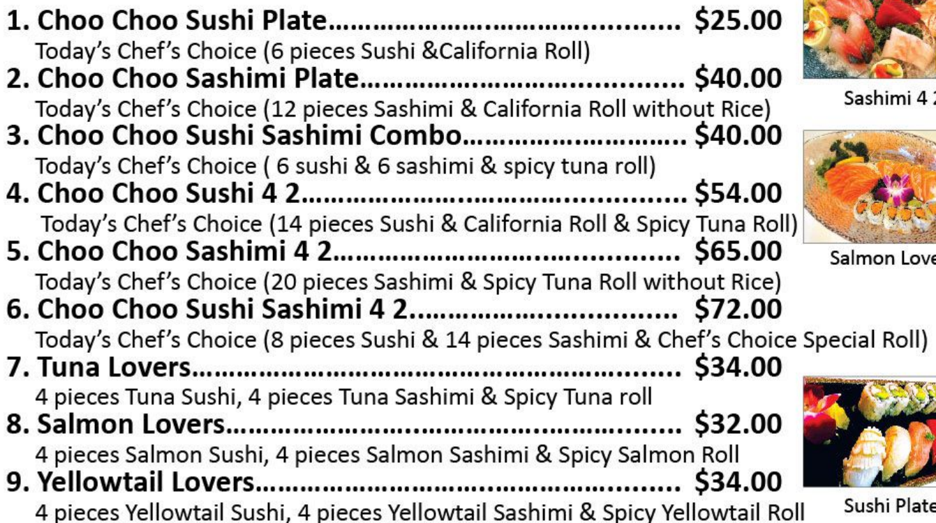
Sashimi 4 2

- Please No Substitutions / Served With Miso Soup -